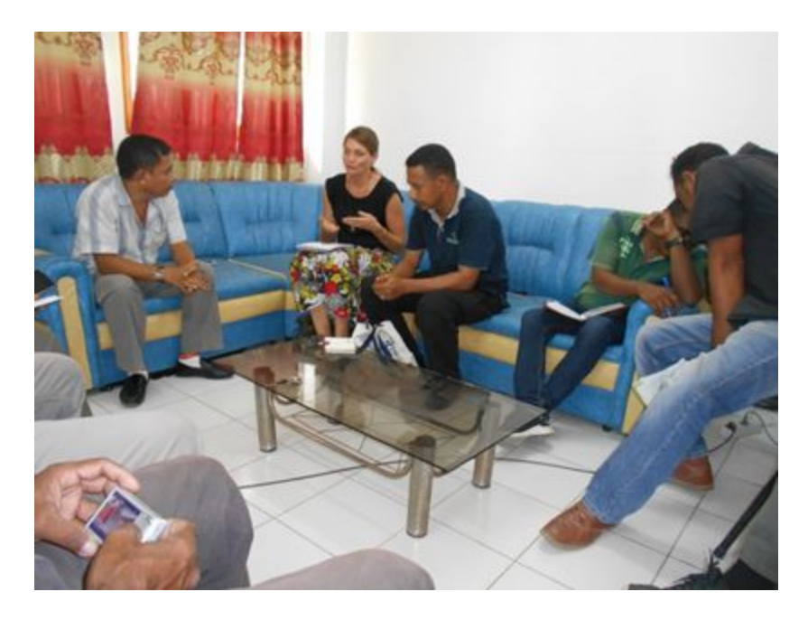
Figure 1. Community meeting to discuss marine management.

The project team held initial meetings to discuss revitalising the lapsed Tara Bandu , receiving positive feedback from community members who welcomed the support offered in monitoring and managing the natural resources of Lamsana Bay. The project team was initially advised that a new Tara Bandu ceremony was required prior to beginning any new marine management in the area. However, beside Ma'abat, three additional villages of Manatuto city (Ailili, Sau and Aiteas) have access to Lamsana Bay, which complicated the consultation process. In 2012, only two of the four village's spiritual leaders were involved in the Tara Bandu development and declaration process, which resulted in political feuds between the local administration and the spiritual leaders, who were found to be in disagreement on what management actions were considered appropriate for Lamsana Bay. As we progressed through consultations, it became clear that the community was hesitant to undertake any activities involved in renewing the Tara Bandu due to this conflict and the sacred nature of the site. This led to the local authorities asking us to suspend consultations temporarily on marine management until the appropriate process was identified by the community leadership.