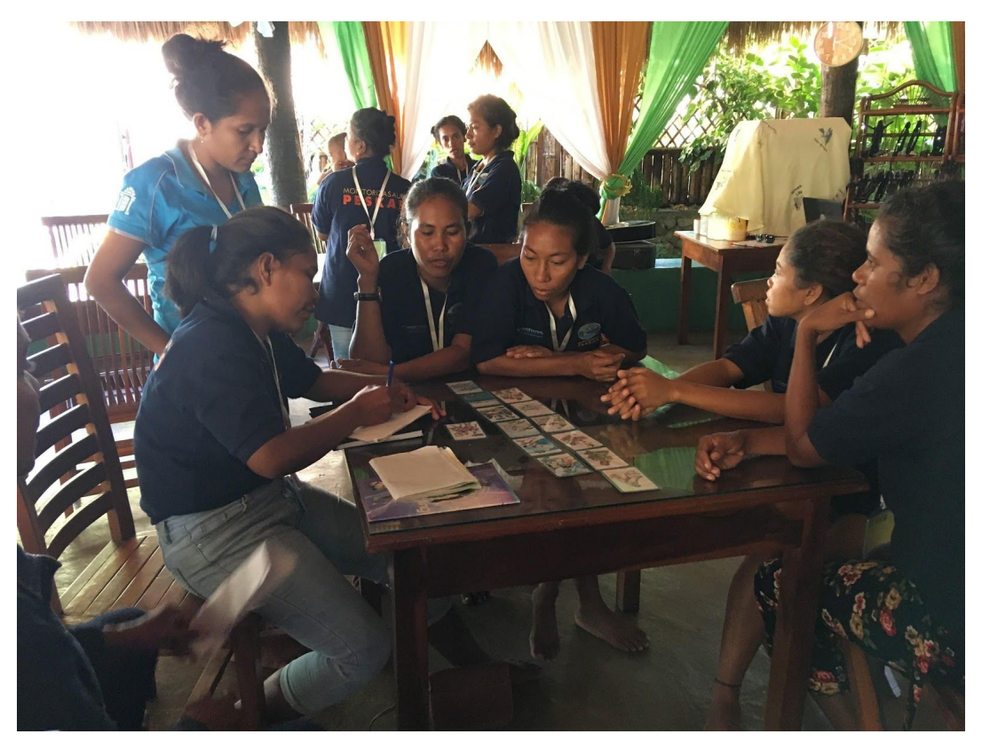
Figure 7: Data collectors discussing community health and environment issues.