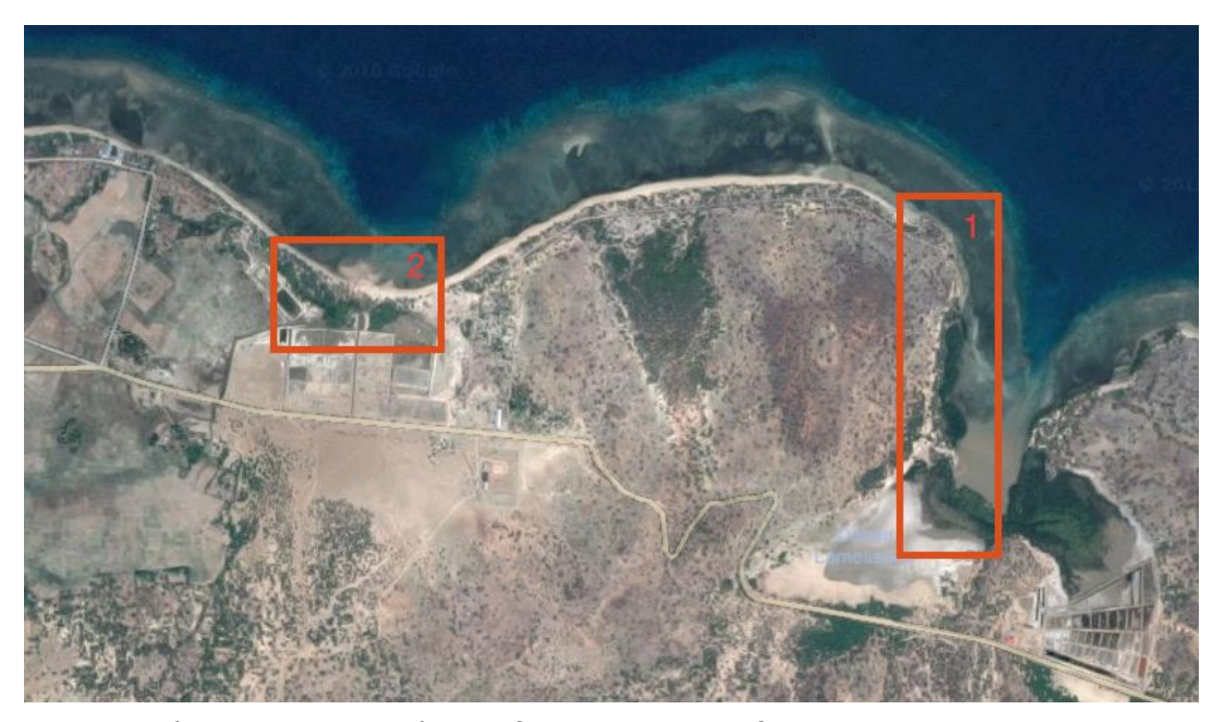
Figure 5: The two proposed sites for mangrove reforestation.

Several mangrove sites can be found in Ma'abat, and reforestation initiatives were previously undertaken in the area. These have unfortunately failed, so the project team put great effort in ensuring the right site and methodology were identified. Two sites were proposed for mangrove reforestation at the second community meeting (see figure 5); a site at Lamsana Bay (site 1), and one in Balak (site 2), which is closer to Ma'abat village and where mangroves are exploited more. The community agreed to develop fisheries monitoring and mangrove reforestation in both sites. In February 2019, the project team and KFF held a field visit to assess both sites' viability for mangrove reforestation. Upon assessment, KFF identified Balak as the most suitable site, and proposed a participatory, community-led reforestation plan, which will be implemented in the second half of 2019.