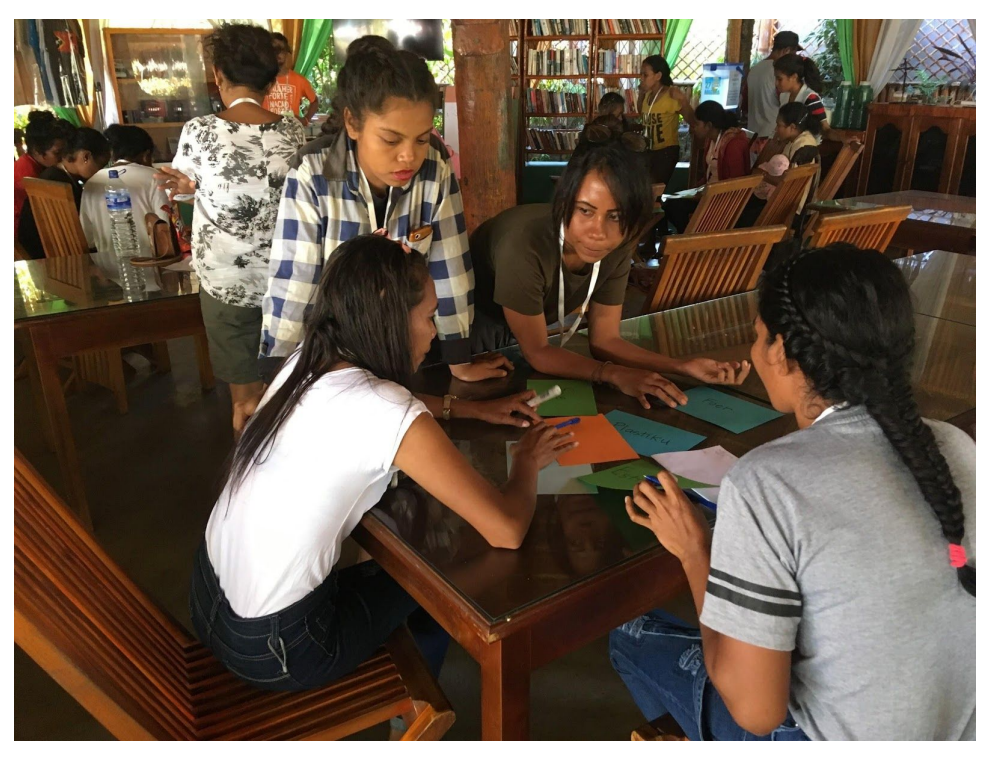
Figure 6: Data collectors at the peer-to-peer learning exchange.

In July 2019, a peer learning exchange trip brought together 20 data collectors from the Blue Ventures fisheries monitoring sites of Behau, Atauro and Ma'abat. The exchange allowed the data collectors to learn from, and share experiences with the other monitoring teams. This is something they requested and has proven to be really valuable in the past as a tool to catalyse interest and enthusiasm for wider marine management.