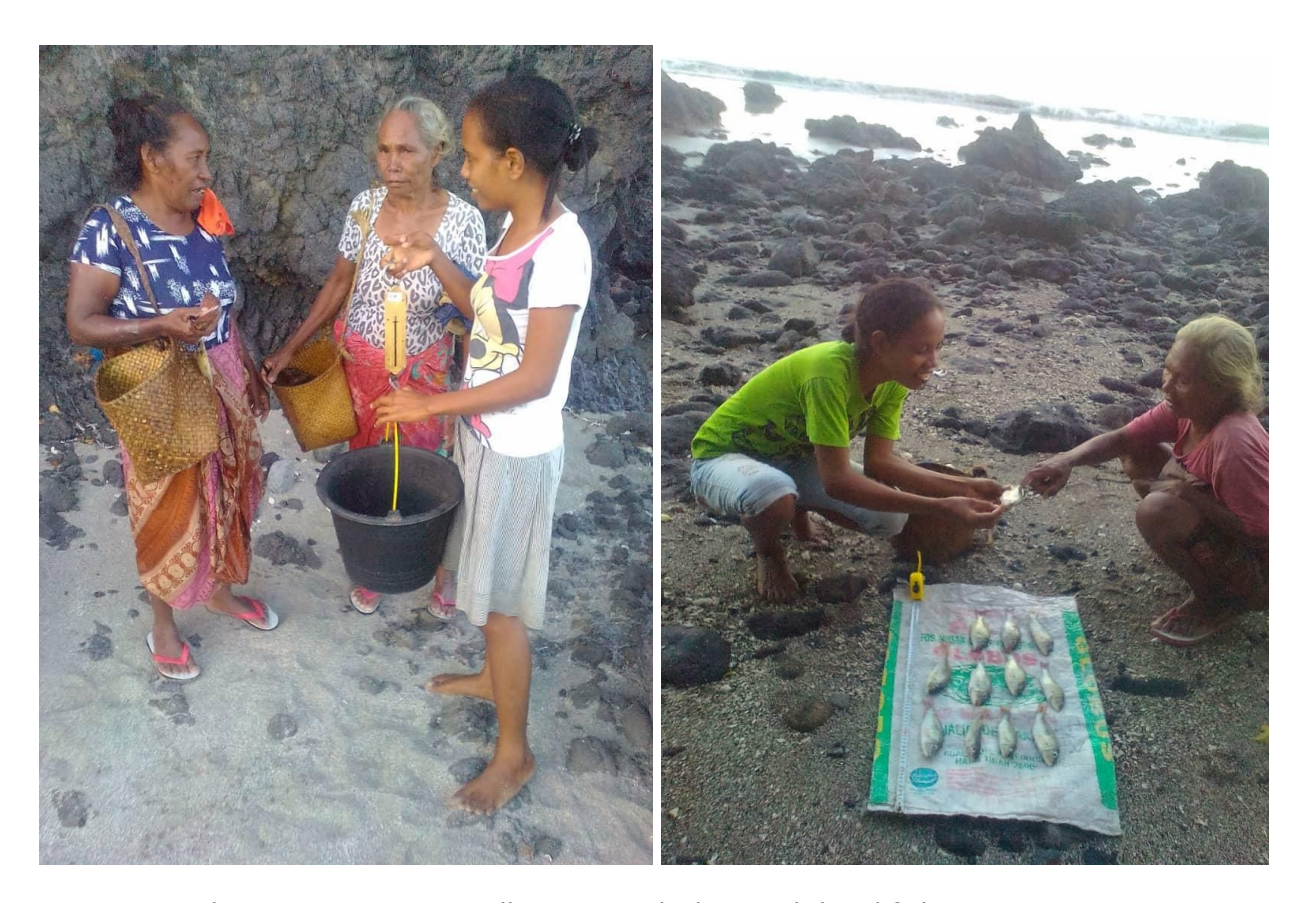
Figures 3 and 4: CFM operators collecting catch data with local fisherwomen.